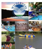
Camp Wilderness Facebook

Celebrating Graduates: The time to celebrate our graduates is today, May 17th! We will be honoring 3 high school graduates and 3 college graduates! We congratulate them all and wish them good luck for their future adventures.